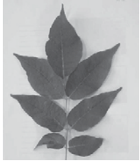
Ash Tree Leaf

Emerald Ash Borer is here in Illinois. The northern portion of the State of Illinois is under a State imposed quarantine relating to ash trees and the Emerald Ash Borer. While there have been no reports of Emerald Ash Borers being found in the Village of North Barrington, the State of Illinois advised that in order to prevent the importation and spread of the Emerald Ash Borer, there should be regulations which prohibit the removal of ash trees, limbs and bark. On August 22, 2007 the Village of North Barrington passed an Ordinance which restricts the movement of potentially infested wood products and encourages residents to purchase only locally-grown nursery stock and locally-cut firewood. The Ordinance in its entirety can be found on the Village's website, www.northbarrington.org . Other informational websites include www.emeraldashborer.info and www.mortonarb.org .